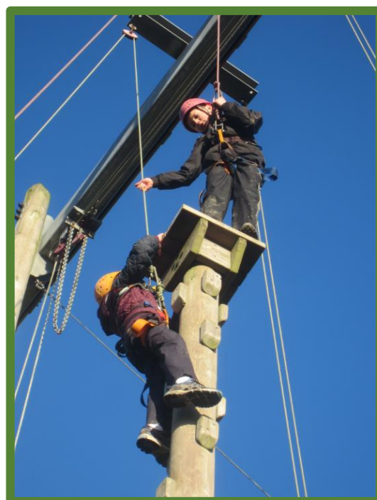
'a bit of teamwork'

The whole Pack, bar one, turned out and the 24 Cubs who attended had great time.