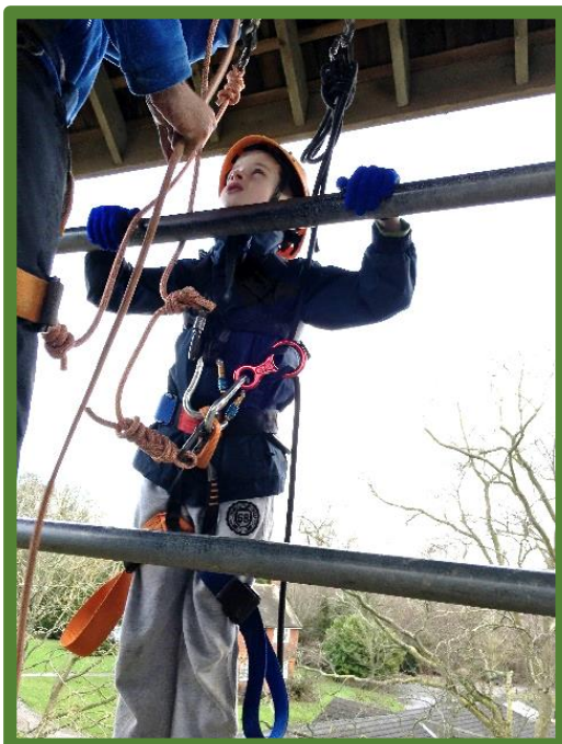
I ain't letting go!

We were the only ones there, apart from staff, and had the run of the place. Activities attempted included climbing, abseiling, all aboard (basically climbing a telegraph pole), archery and fencing.